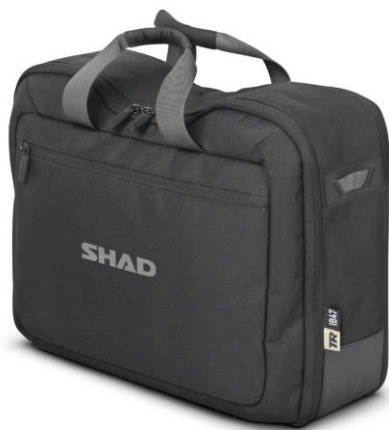
Inner bag X0IB47